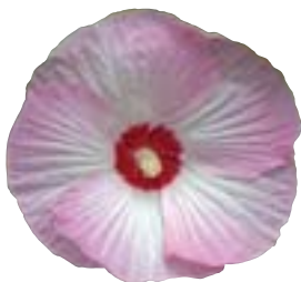
Luna Pink Swirl Hibiscus