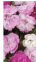
Dynasty Pink Magic Dianthus