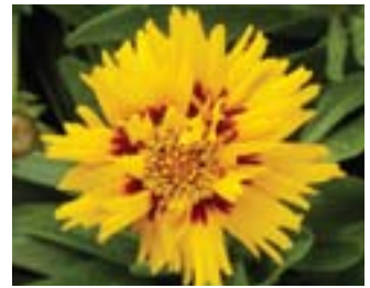
Rising Sun Coreopsis