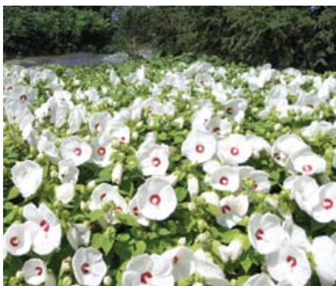
Luna White Hibiscus