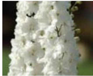
Guardian White Delphinium