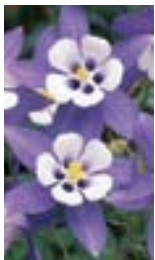
Songbird Bunting Aquilegia

Burgundy & White and Yellow are Royal Horticultural Society Award of Garden Merit winners.