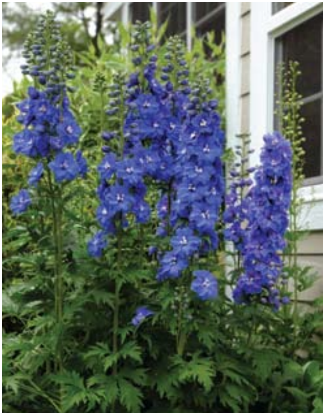
Guardian Blue Delphinium