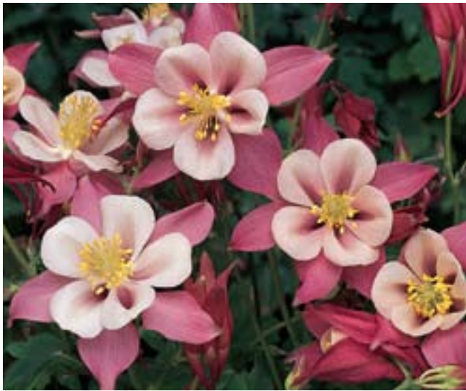
Songbird Robin Aquilegia