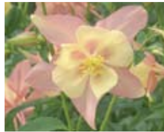
Swan Pink and Yellow Aquilegia