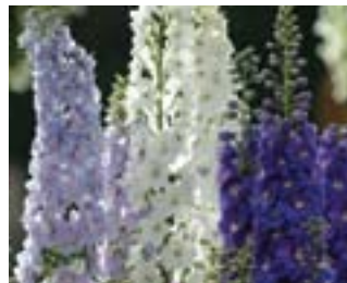
Guardian Mixture Delphinium