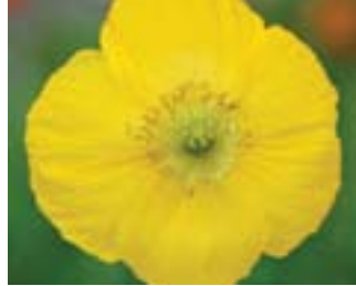
Champagne Bubbles Yellow Iceland Poppy

The branched spikes are covered with many tubular, fade-resistant lavender blooms. Adapted to warm climates, plants prefer dry conditions and light watering. No vernalization is required for flowering.