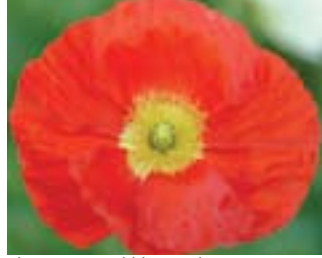
Champagne Bubbles Scarlet Iceland Poppy