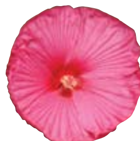
Luna Rose Hibiscus