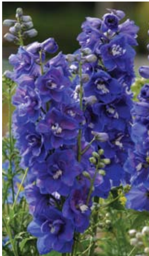
Dasante Blue Delphinium