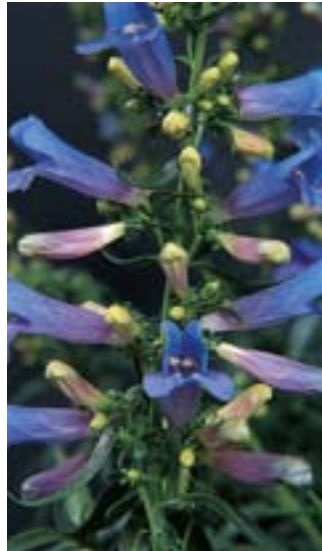
Electric Blue Penstemon