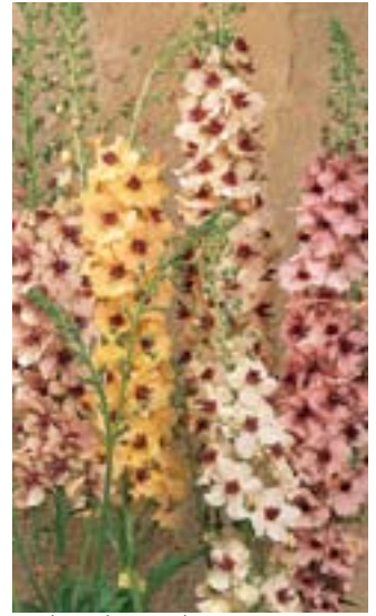
Southern Charm Verbascum