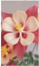
Swan Rose and White Aquilegia