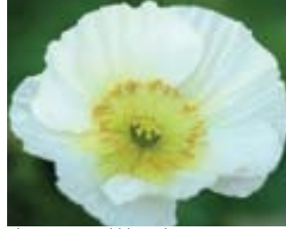
Champagne Bubbles White Iceland Poppy