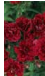
Dynasty Red Dianthus