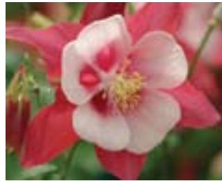
Songbird Cardinal Aquilegia