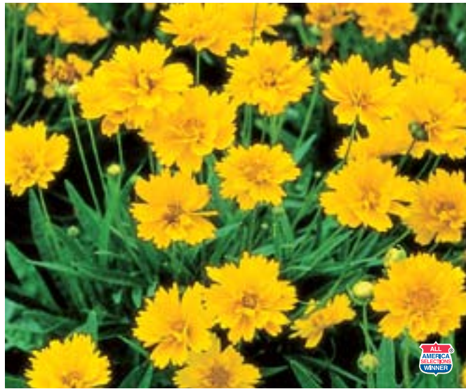
Early Sunrise Coreopsis

One of the "Plants Rated as Superior" for 2009 at Colorado State University.