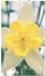
Swan Yellow Aquilegia