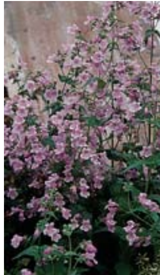
Violet Dusk Penstemon