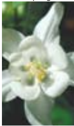
Swan White Aquilegia