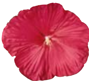
Luna Red Hibiscus