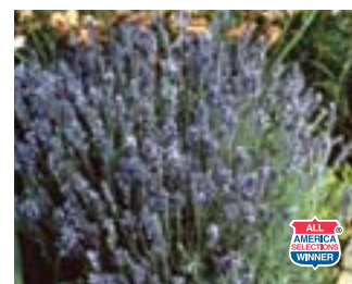
Lavender Lady Lavender