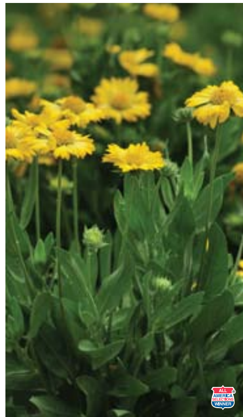
Mesa Yellow Gaillardia