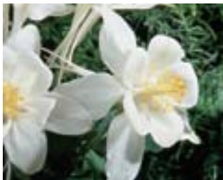
Songbird Dove Aquilegia