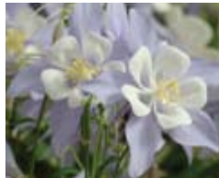
Songbird Bluebird Aquilegia