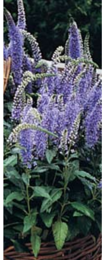
Blue Bouquet Veronica