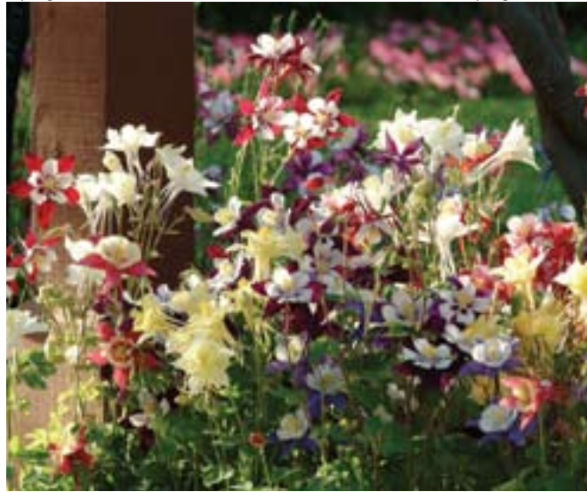
Swan Mixture Aquilegia