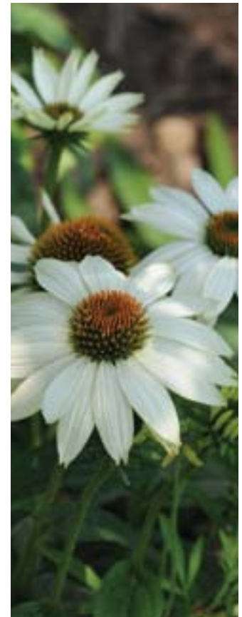
NEW PowWow White Echinacea

Wild Berry is a 2010 All-America Selections winner.