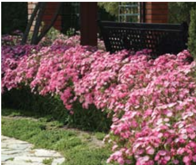
Bouquet Rose Magic Dianthus

Orchid is a Royal Horticultural Society Award of Garden Merit winner.