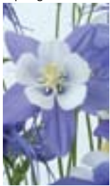
Swan Blue and White Aquilegia