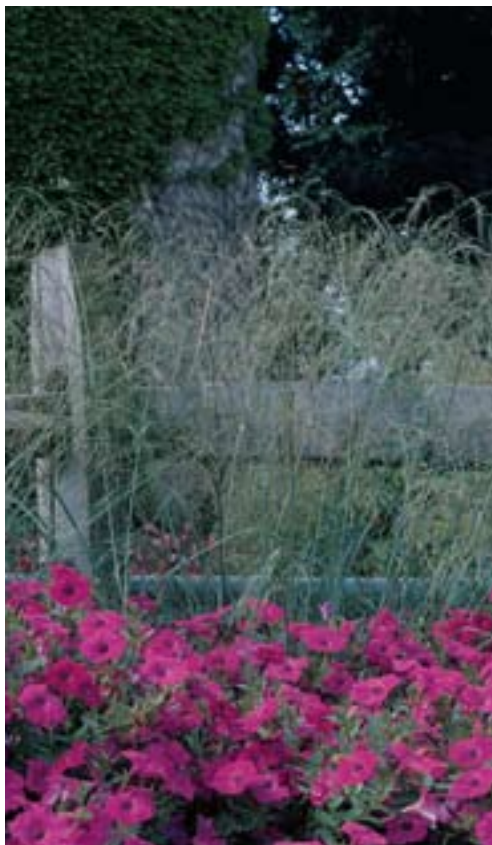
Wind Dancer Eragrotsis

A 2010 All-America Selections winner and a 2010 Fleuroselect Gold Medal winner.