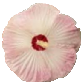
Luna Blush Hibiscus