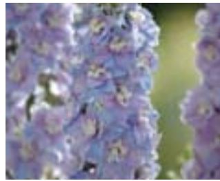
Guardian Lavender Delphinium