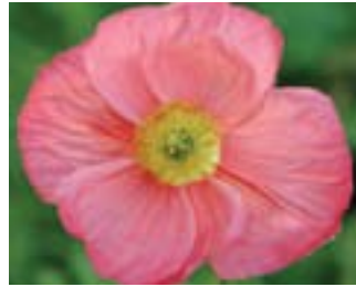
Champagne Bubbles Pink Iceland Poppy