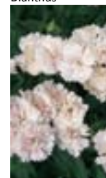
Dynasty White Blush Dianthus