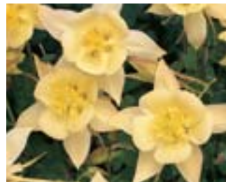
Songbird Goldfinch Aquilegia