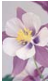
Swan Lavender Aquilegia