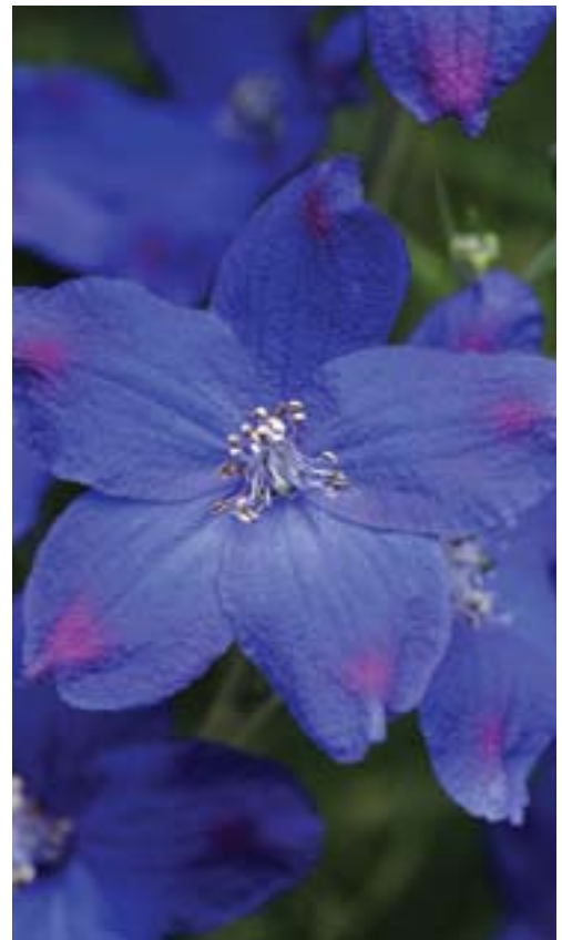
Diamonds Blue Delphinium