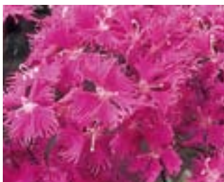
Bouquet Purple Dianthus