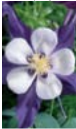
Swan Violet and White Aquilegia