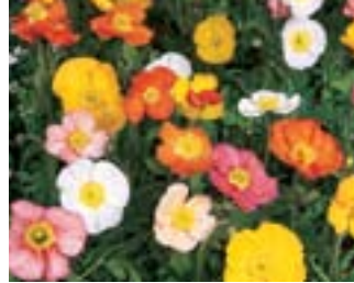
Champagne Bubbles Mixture Iceland Poppy