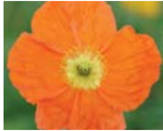
Champagne Bubbles Orange Iceland Poppy

Hybrid vigor delivers uniform flowers, earliness and long-lasting garden performance compared to O.P. varieties. Many large, cup-shaped flowers top bushy strong-stemmed plants. Performs well in hot-day, cool-night conditions, and is a good Winter item in Florida, California and comparable climates. Mixture includes all colors plus Apricot. Not pictured: Citrus Mixture