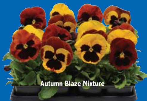
Autumn Blaze Mixture