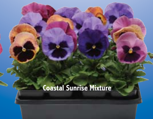
Coastal Sunrise Mixture