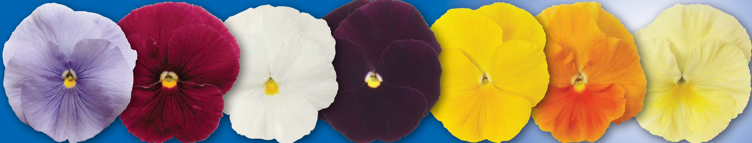
NEW Light Blue