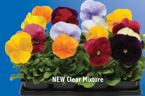
NEW Clear Mixture