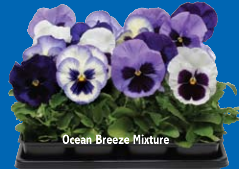
Ocean Breeze Mixture