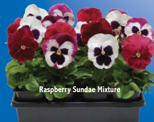
Raspberry Sundae Mixture