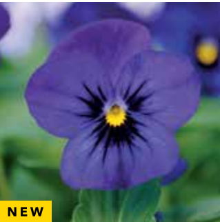
Sorbet XP Blue Blotch Improved