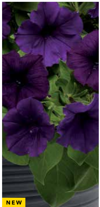
Combo Blue Petunia