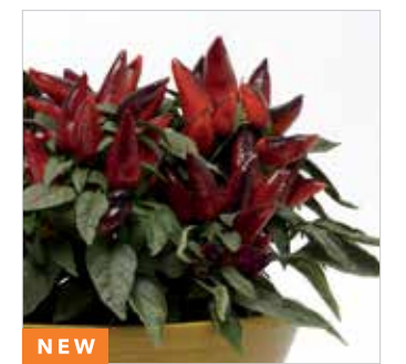
Wicked Ornamental Pepper