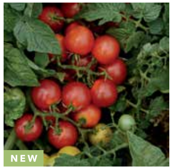
Little Bing Cherry Tomato

be grown successfully with or without a trellis.