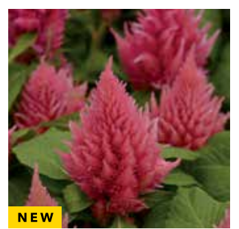
Ice Cream Salmon Celosia