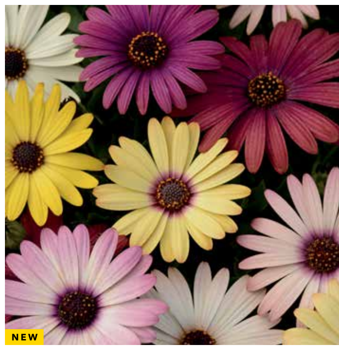
Akila Grand Canyon Mixture Osteospermum