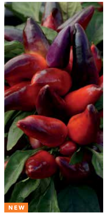
Wicked Ornamental Pepper

pots to gallons. • Fruit has medium heat.