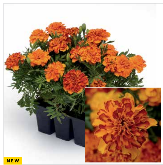
Bonanza Bolero Improved French Marigold