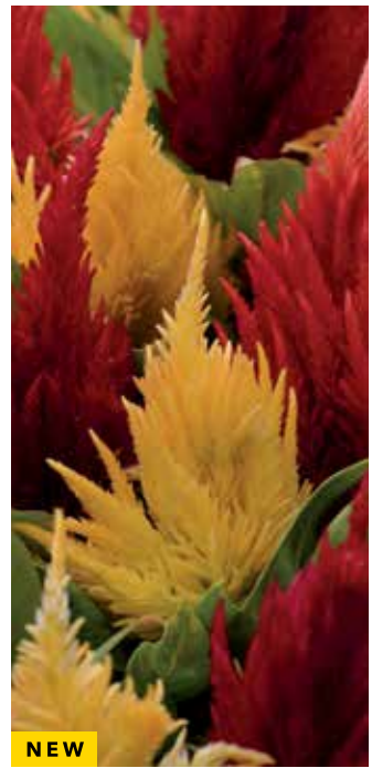
First Flame Mixture Celosia