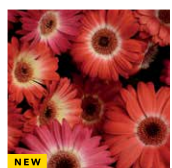
Revolution Bicolor Mixture

Flower timing is synchronized across the colour range in each Revolution series, so your product flows smoothly. No surprises...you grow, pick, pack and ship just as you planned. High uniformity enables consistent, fully programmable, high-density crops year-round.