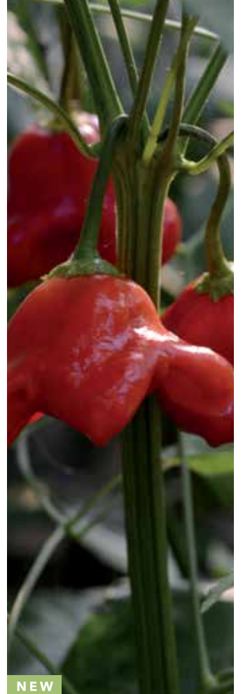
Mad Hatter Specialty/Hot Pepper