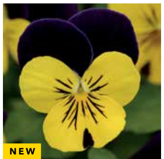
Sorbet Yellow Violet Jump Up