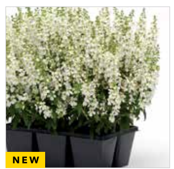
Serena White Improved Angelonia

ANGELONIA <sup>O</sup> Angelonia angustifolia