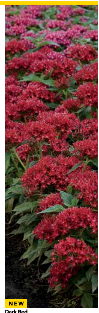
Lucky Star Series