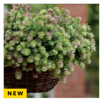
Kirigami Ornamental Oregano