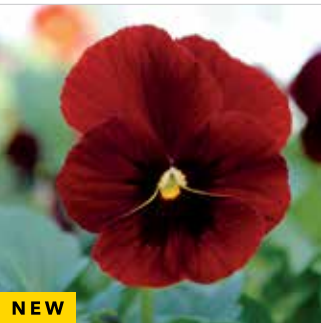
Sorbet XP Red Blotch