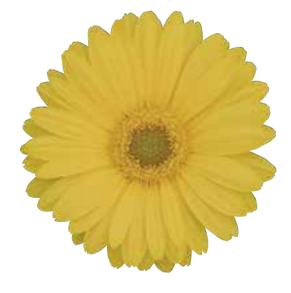
NEW Revolution Yellow with Light Eye Improved