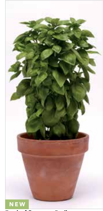
Everleaf Genovese Basil