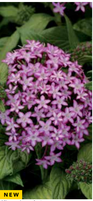
Glitterati Purple Star Pentas