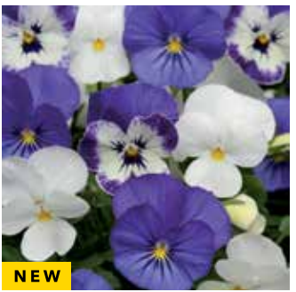
Sorbet XP Blueberry Sundae Mixture