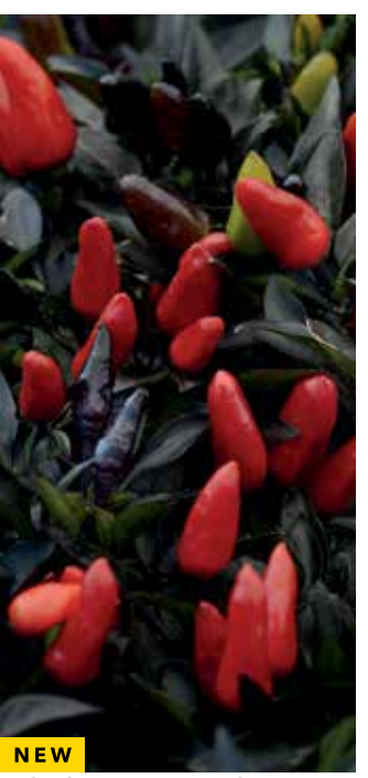
Midnight Fire Ornamental Pepper

• NOTE: Jade Princess requires warmer temperatures (above 60°F/16°C) than other millets to perform well.