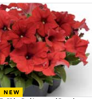
Ez Rider Red Improved Petunia

New Red Improved It's a Grand Slam with 4 big upgrades: Deeper red colour, flower timing that matches White, better plant habit and improved holding.