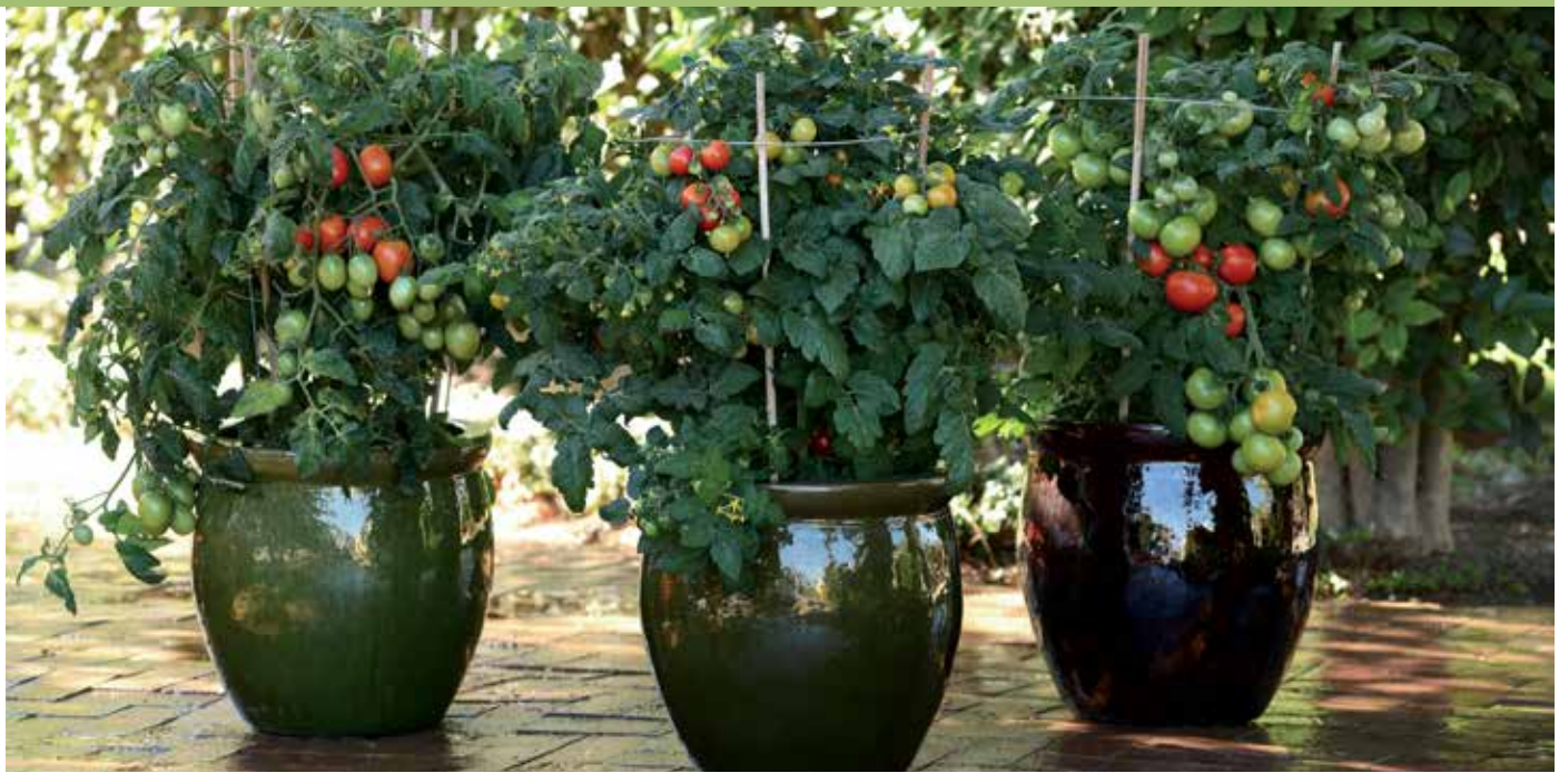
Little Tomato Collection L to R: Little Napoli, NEW Little Bing and NEW Little Sicily