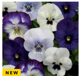
Sorbet XP Ocean Breeze Mixture