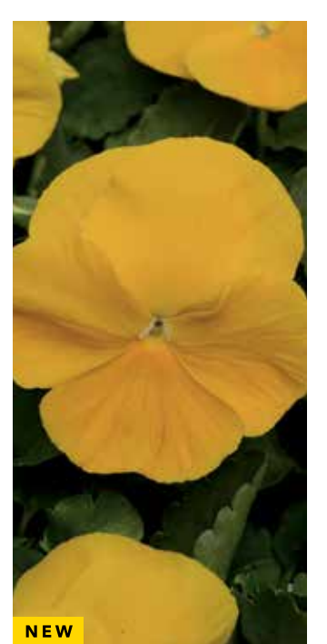
Matrix Yellow Improved Pansy