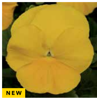
Promise Pure Yellow Improved Pansy

New Pure Yellow Improved 7 to 10 days earlier in Spring production than original Pure Yellow. The plant is more compact, stretches less and has shorter peduncles, giving growers in Northern EU the best choice in this key colour segment.