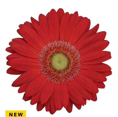
Revolution Red with Light Eye Improved

New Deep Rose with Light Eye Superior dark colour is great for mixes and combo pots, and fits well with the rest of the series. Colour holds very well under high light levels. Replaces Purple Shades.