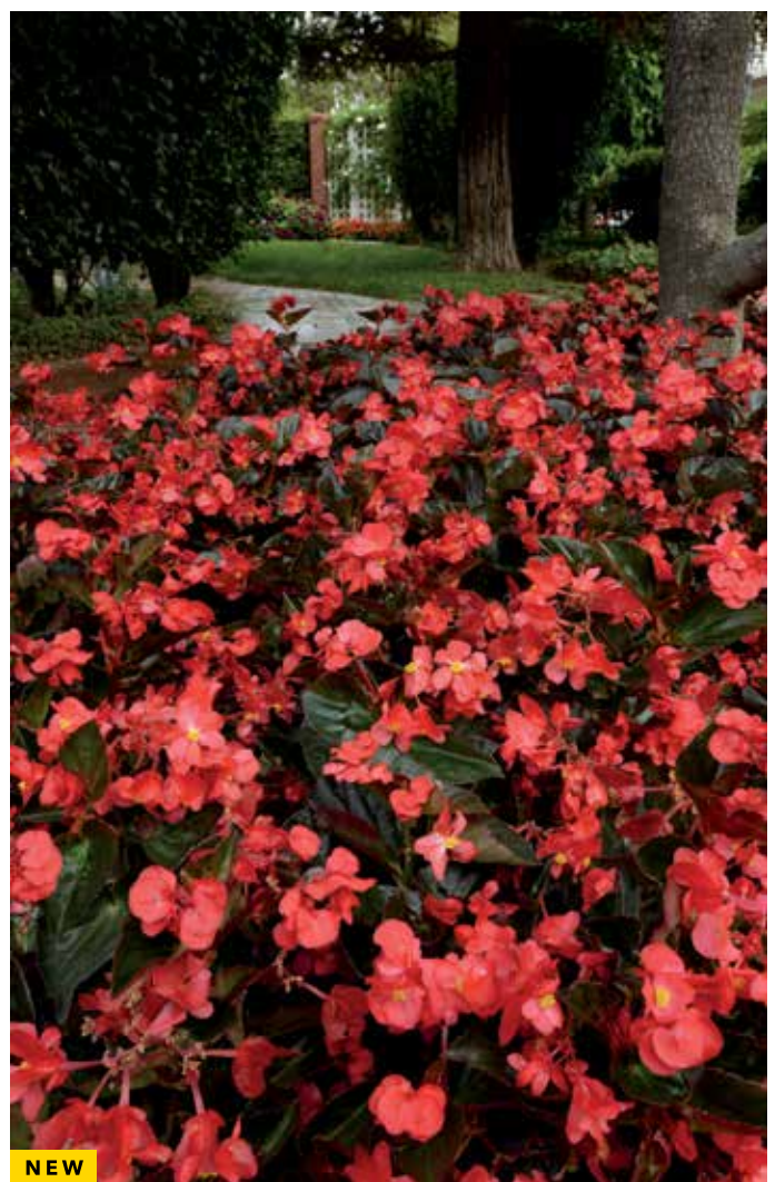
Red Bronze Leaf