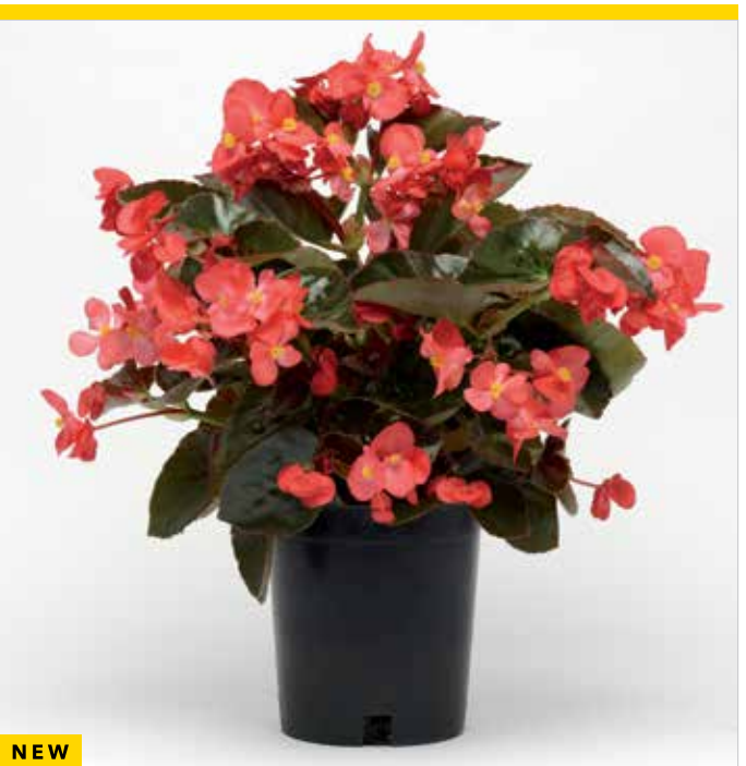
Red Bronze Leaf