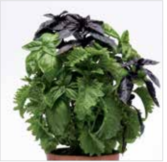
SimplyHerbs 'Try Basil'