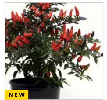
Midnight Fire Ornamental Pepper