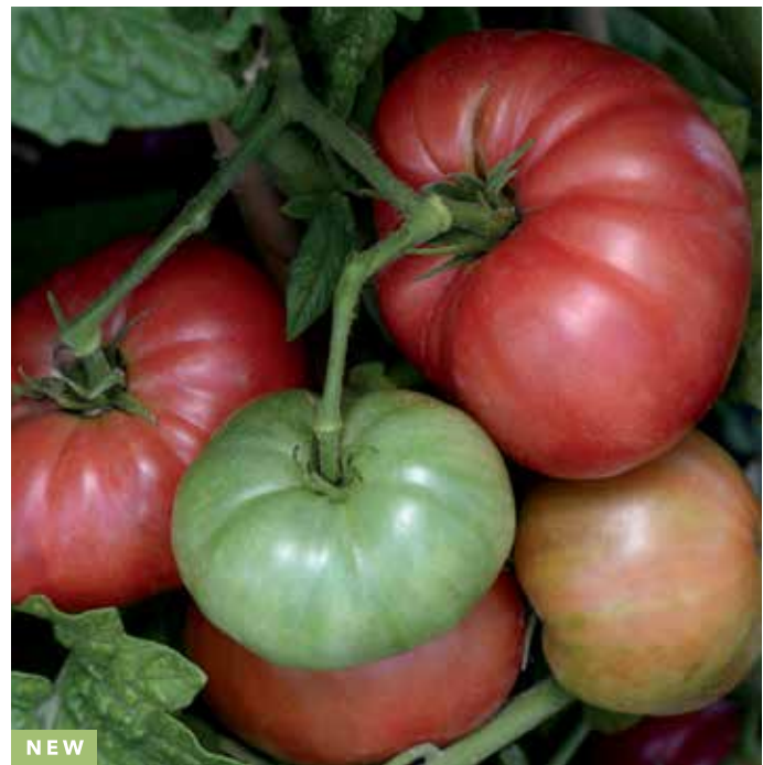
Tidy Rose Beefsteak Tomato