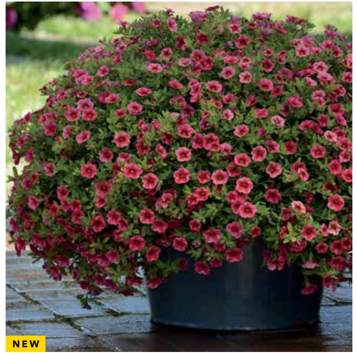
Crave Strawberry Star Calibrachoa