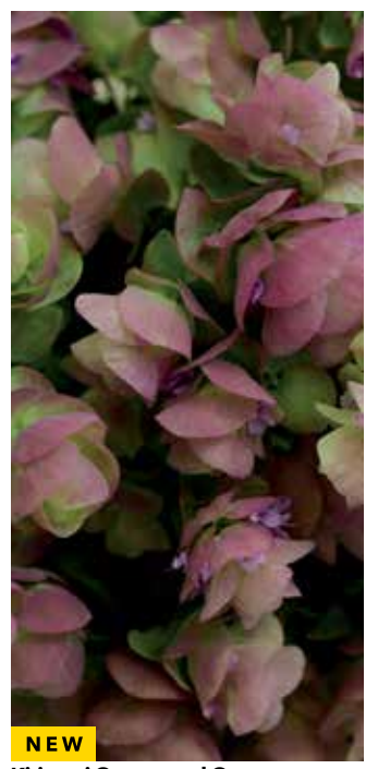
Kirigami Ornamental Oregano