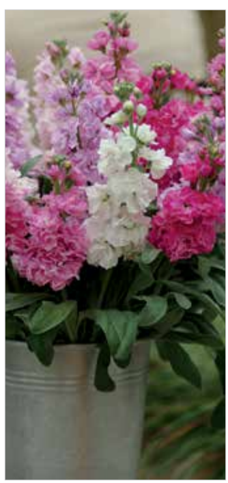
Katz Series Matthiola

New Dark Orange Improved (Group 2) More uniform stems, thicker caliper and better taper than original. Replaces Maryland Golden Bronze and Maryland Dark Orange, allowing cut flower growers to streamline their production with one best-in-colourclass variety.