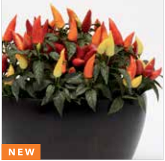
Harlequin Ornamental Pepper