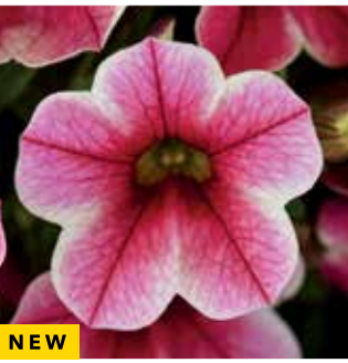
Crave Strawberry Star Calibrachoa

New White Improved Times like current White, with faster secondary flowering. Plants are retail-ready faster, especially for the first shipments.