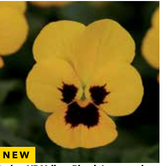
Sorbet XP Yellow Blotch Improved