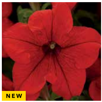
Pretty Grand Red Improved Petunia

New Appleblossom Clean white colour is brushed with soft yellow and rose tones. The habit and timing match the other bicolours in the series.