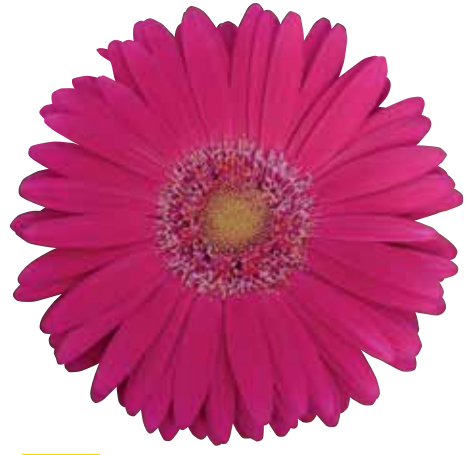
NEW Mega Revolution Deep Rose with Light Eye