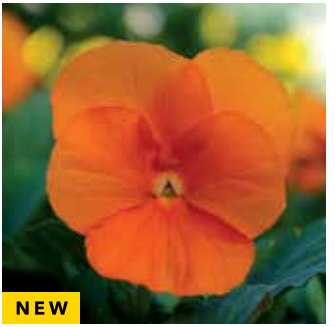
Sorbet XP Deep Orange