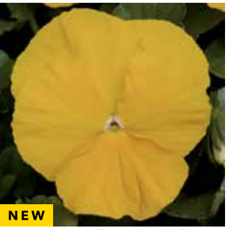
Spring Matrix Yellow Improved Pansy

New Yellow Improved Produces a slightly larger, more well-branched plant than original Yellow. Earlier in Spring production by about 5 days.