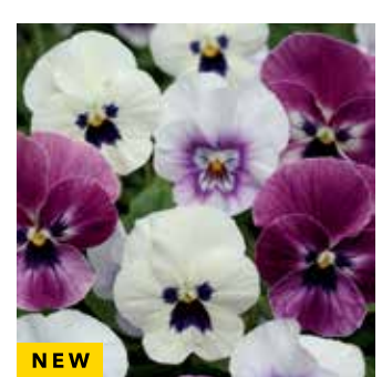
Sorbet XP Raspberry Sundae Mixture