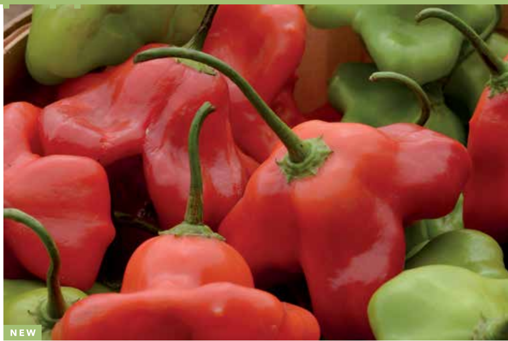
Mad Hatter Specialty/Hot Pepper