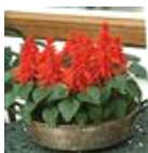
Red Hot Sally II