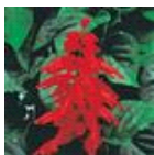
Red Hot Sally II