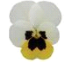
Lemon Ice Blotch