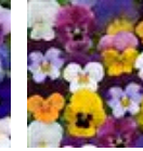
Spring Select Mixture