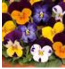
Jump Up Mixture