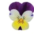
Lemon Jump Up