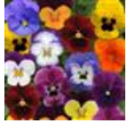
Autumn Select Mixture