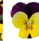
Yellow Jump Up