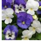
Blueberry Sundae Mixture