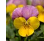
Yellow Pink Jump Up